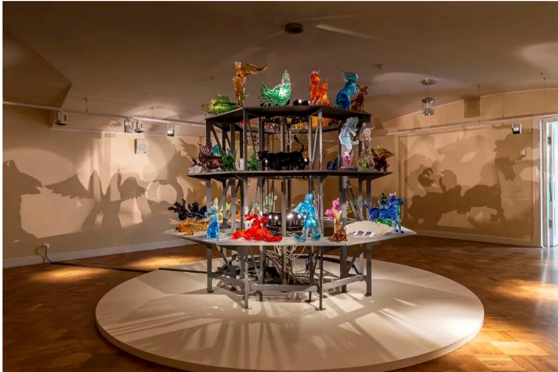
Even More Mythical Animals Are on Their Way , Qiu Zhijie.

The work ' Even More Mythical Animals Are on Their Way ,' by Chinese artist Qiu Zhijie combines the symbols of Eastern gods with glassstress. By leveraging the transparency of glass and the refraction of stress, this work enables traditional cultural symbols to gain a new life in the contemporary context, achieving a congruence between the material characteristics and the cultural spirit.