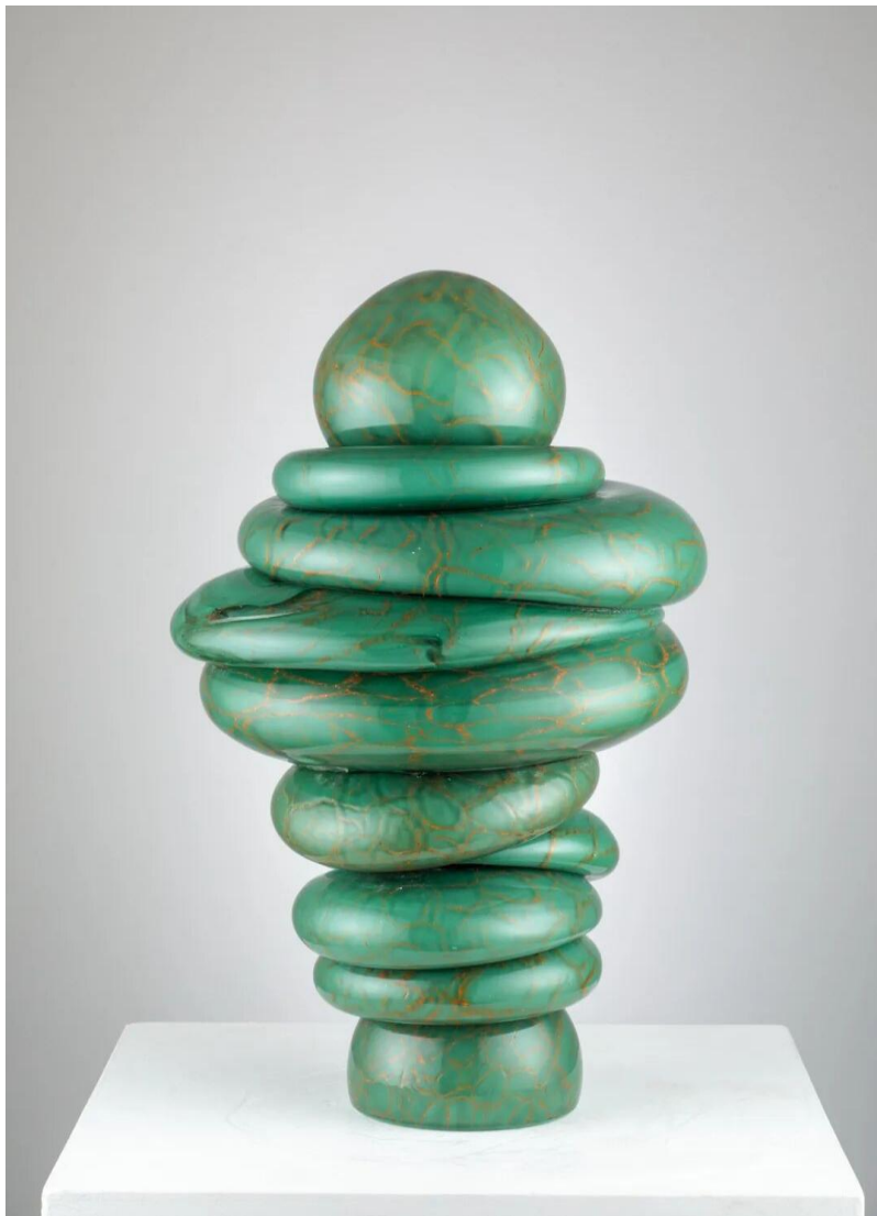
Spine Green , Tony Cragg.

In the exhibition, British artist Tony Cragg's 'Spine Green' is made of molten glass. Through precise control of the annealing speed, natural stress patterns are formed inside the glass, simulating the texture and tension of plant growth. In the changing light and shadow, the resilience and fragility of life are presented, and the glasstress is transformed into an expression of life imagery.