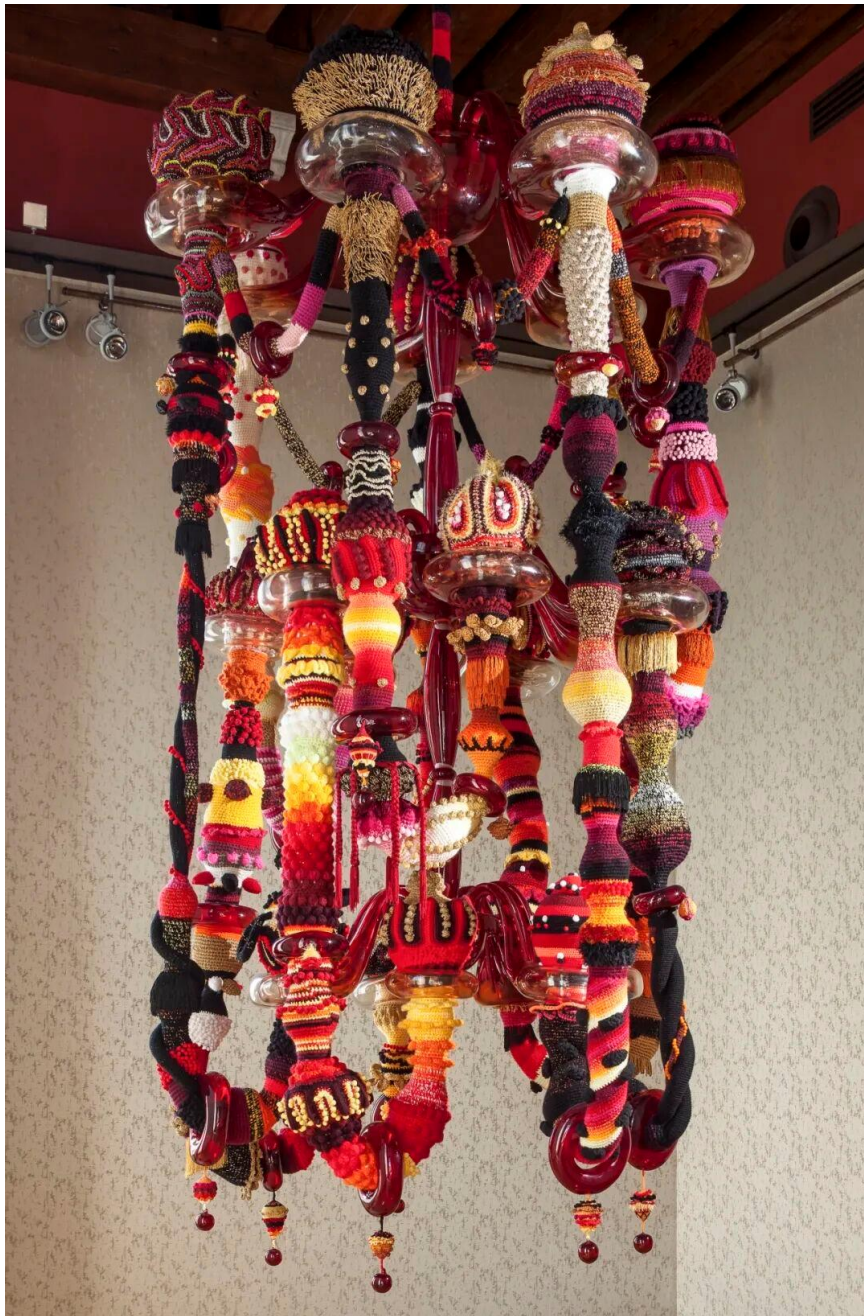
Babylon , Joana Vasconcelos.

Portuguese artist Joana Vasconcelos is internationally celebrated for her exuberant, large-scale installations, and was the first female artist to hold a solo exhibition at the Palace of Versailles. She is adept at deconstructing traditional aesthetics through everyday materials and amplified scale, frequently employing textiles, plastic vessels, and kitchen utensils, assembling them into vividly colored, structurally complex installations of architectural proportion.