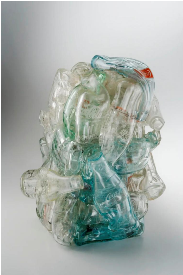
Compression , César Baldaccini.

The French artist César Baldaccini was one of the most important sculptors in post-war France and played a central role in the New Realism movement. He compressed objects such as cars and industrial materials, and transformed ready-made items into dense blocks through twisting, stacking, and collapsing. By doing so, he transformed common everyday objects into artistic forms full of visual tension and raw power. In this exhibition, his work 'Compression' uses industrial glass as the material. Through external force compression, it creates controllable stress deformation, and uses the 'critical state' of glass stress to metaphorically represent the pressure and balance of modern society.